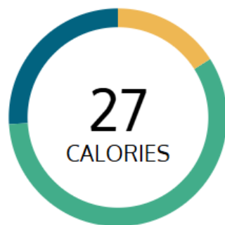
WHERE DO THE CALORIES COME FROM?