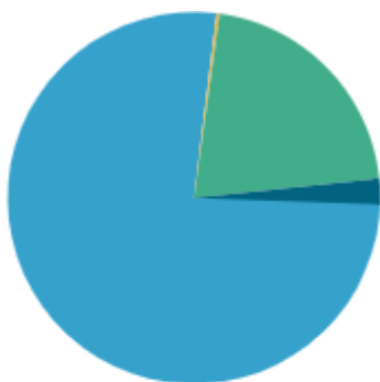
WHAT IS THIS FOOD MADE OF?

As for nutrition, the sweet potato contains vitamins such as beta-carotene, vitamin A, vitamin C, and a number of B vitamins. It also contains minerals such as manganese, copper, potassium, and phosphorus.