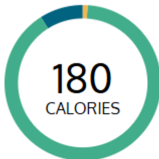
WHERE DO THE CALORIES COME FROM?